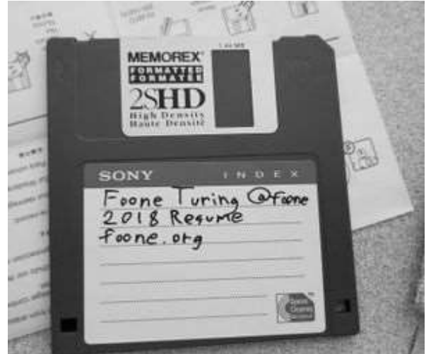
My resume in a more traditional form